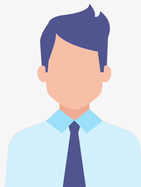
IT Team Head