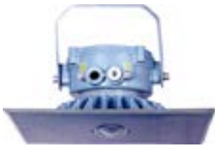
(WITH SS PLATE)