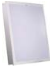
20 W (1X1)