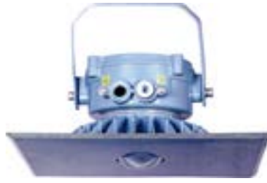
(WITH SS PLATE)