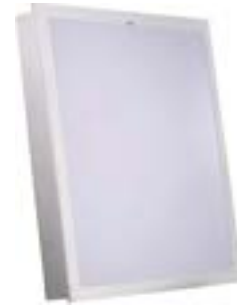
60/80/100 W (2X2)