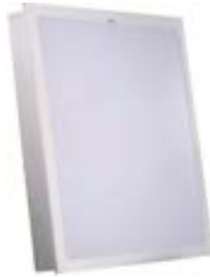
30/40/48 W (2X2)