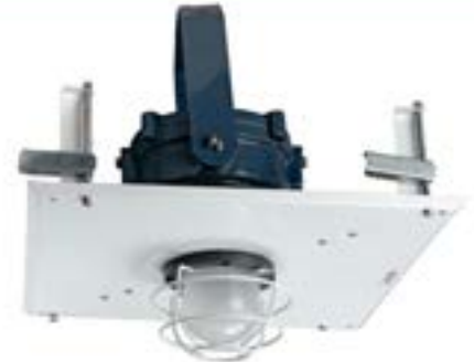
(WITH MS PLATE)