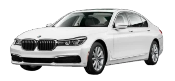
E Deluxe cars

Skoda Laura, Skoda superb, Toyota Camry, BMW 7 series, Mercedes Benz E class, Mercedes Benz C class.