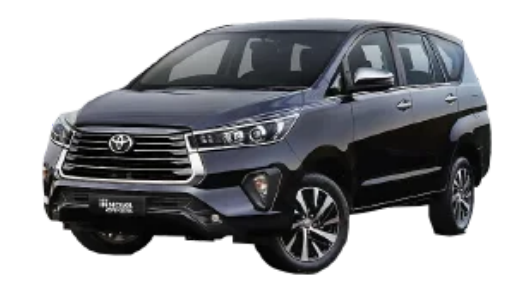
C Multiple Class

Maruti Dzire, Hyundai Accent, Toyoto Etios, Tata zest, Ford fiesta, Hyundai Aura.