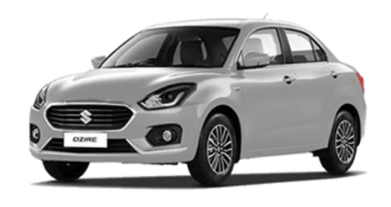
B Medium Class

Toyotacorolla, Skoda Octavia, Volkswagan Jetta, Honda city, Maruti Ciaz