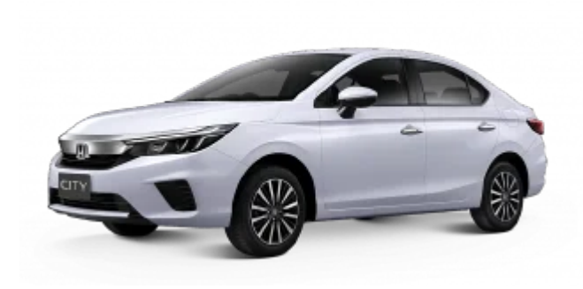
D Premium class

Skoda Laura, Skoda superb, Toyota Camry, BMW 7 series, Mercedes Benz E class, Mercedes Benz C class.